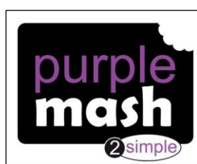
Nursery - Y6