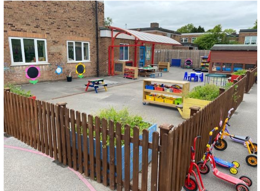
The Reception Outdoor Area