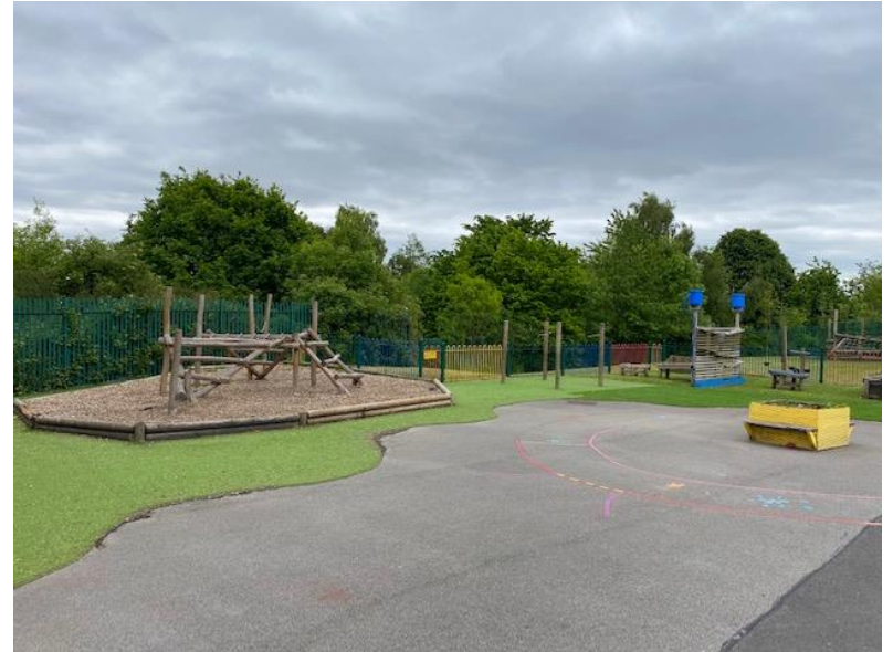
The Reception Outdoor Area